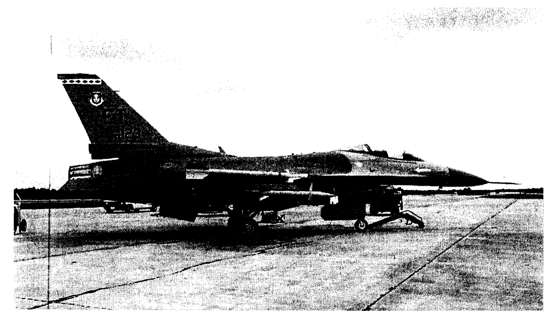
This F-16 is still active at Eglin AFB, Fla., as a test aircraft. F-16s were used against MiG-25 intruders of the no-fly zone.

down a MiG-25 "Foxbat" aircraft. The American delegate to the UN delivered a demarché to the Iraqi delegate on January 6, 1993 over the violation of the southern no-fly zone and the threatening deployment of Iraqi surface-to-air missile systems to southern Iraq. Operation SOUTHERN WATCH forces subsequently met Iraq's refusal to remove the threatening missile systems by attacking both missile sites and the Zaafaraniyah Nuclear Fabrication Facility near Baghdad. On January 13–18, USAF aircraft struck missile sites in southern Iraq. Later, four USN warships launched forty-five Tomahawk landattack missiles against the nuclear facility, followed by more USAF and coalition attacks against several missile and command and control sites in southern Iraq.